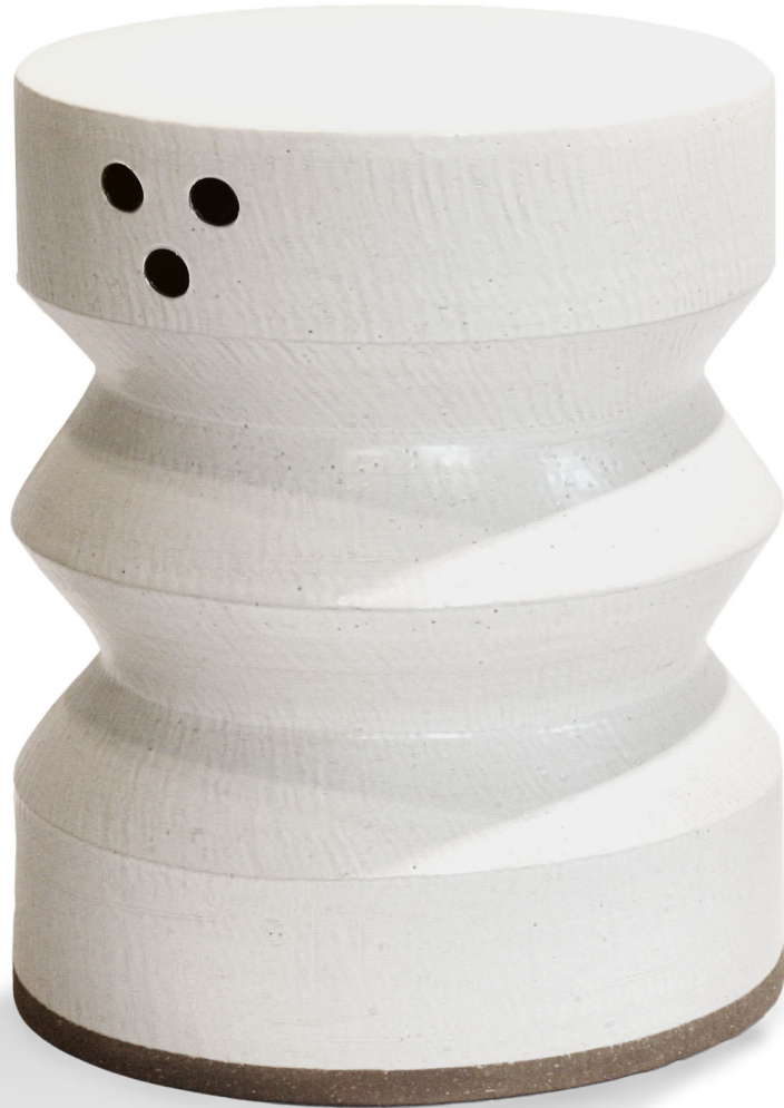
Porcelain Zig Zag Featured: White